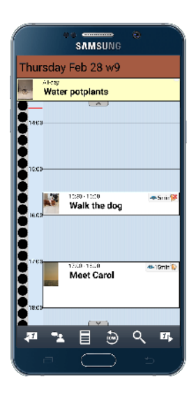
Example: Time pillar on Android